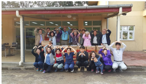
160701_Commemorating the gift from MyungSung Church on its Anniversary