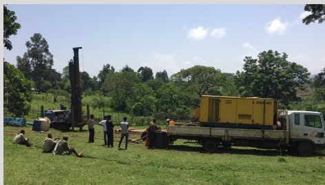
June 1st to 3rd, TALO