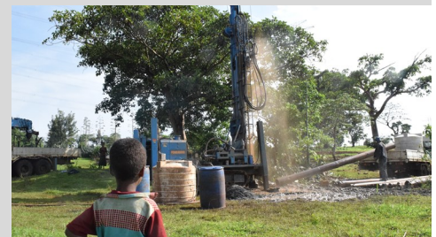
June 6th to 9th, DEMBI DIMA

The well drilling still remains at East Wollega and Horo Guduru, and total 22 wells, 6 was completed and only from 3 wells water came out. This project received from Oromia Government. And there was a Govern officer' s request that rest of the 16 issues restart after rain–season. Next part, introducing dramatized episode in the site.