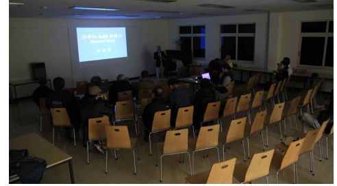
160625_History lecture of the 6.25. Korean War