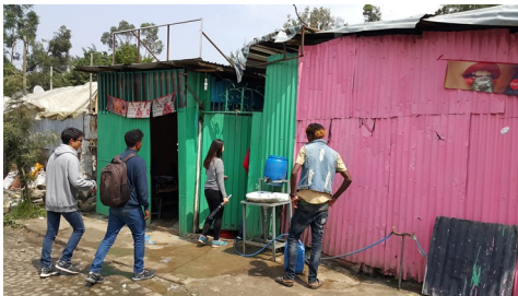
160703_Visiting of Ethiopian home by Good News International Church youth group