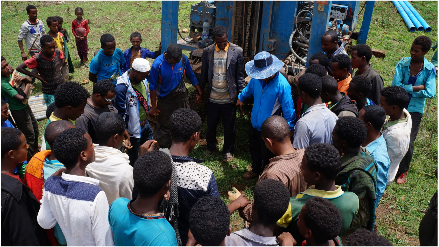
The drilling well at Nekemete area in west Ethiopia was processed from May 3th to June 13th.