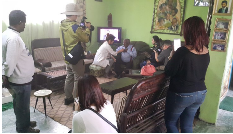
160601_Free home care visit for veterans who participated in the Korea War