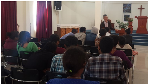
160629_Korean study for Ethiopian