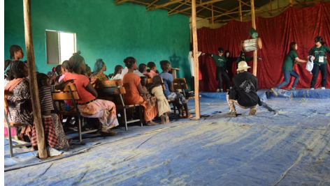
Visited local churches