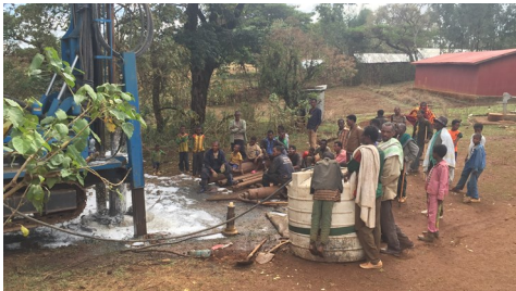
May 3rd to 12th, ABO