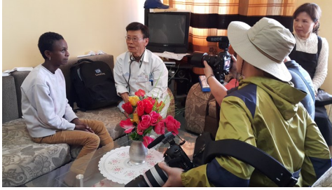
160601_Visiting of patient' s home after heart surgery