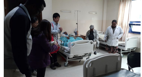
Visited the wards of MCM Hospital