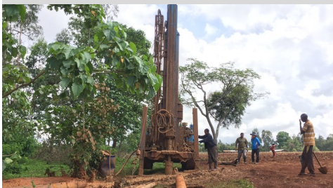
May 28th to 30th, BABO