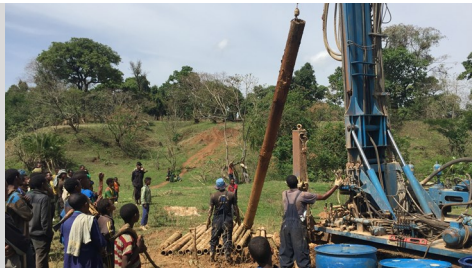
May 13th to 15th, KUTIN