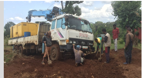
May 16th to 19th, ASHU