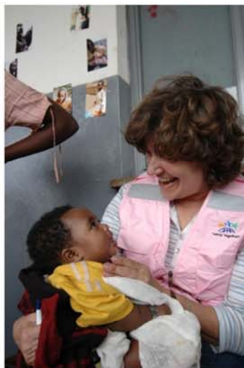
Children love attention.

Many rural areas do not have access to fresh, clean water. MCM, in partnership with World Together, is drilling for underground water to develop water resources for drinking, washing, bathing, and for agricultural use