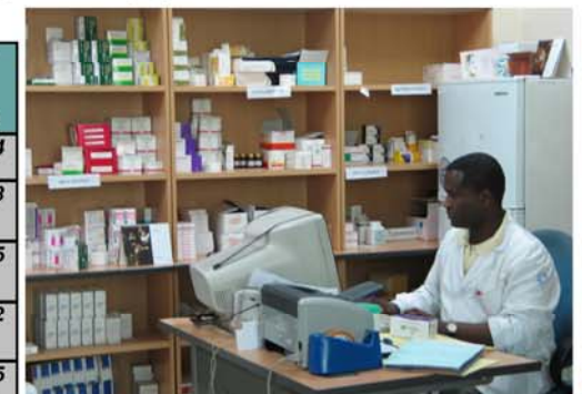
A druggist enters pharmaceutical data in our pharmacy dispensary.