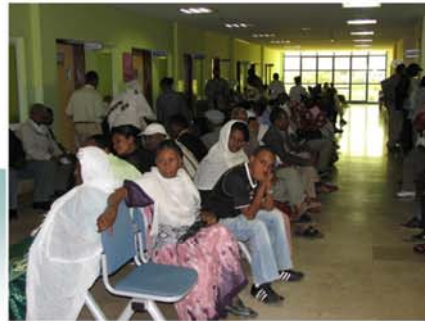
Outpatients waiting to see their doctors.

We currently offer 24-hour general medicine and pediatrics service. We are working to provide around-the-clock internal medicine care.