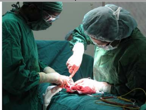
Surgeons at work

Total No. of Surgeries Performed in 2007: 2,820