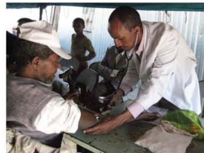
A doctor attends to a mobile clinic patient.

MCM has been sponsoring evangelists in the countryside of Ethiopia. Currently we are sponsoring two evangelists.