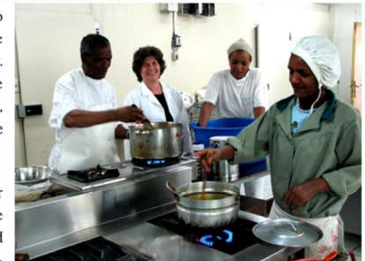
Food preparation in the kitchen

teria. All day coffee, tea, soda, and various snacks are available. It serves over 200 people for breakfast and lunch each day. The Food Service Department tries to provide good nutritious food which is important for good health.