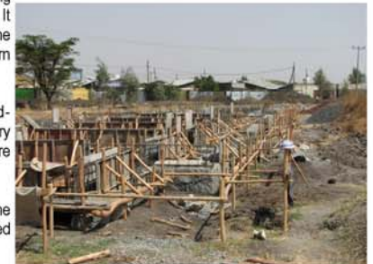
New Guesthouse Under Construction

There are some major changes which are being planned for 2008. One of them is the establishment of the first Trauma Center in Ethiopia at MCM. Another is the building of a Burn Treatment Center. A new Guest House is already under construction. Many volunteers from other countries are planned for the Hospital. They will help out not only clinically, but also by training and presenting lectures. In addition, MCM also hopes to partner with COSECSA (College of Surgeons of East, Central, and Southern Africa) to train more resident specialists from other hospitals.