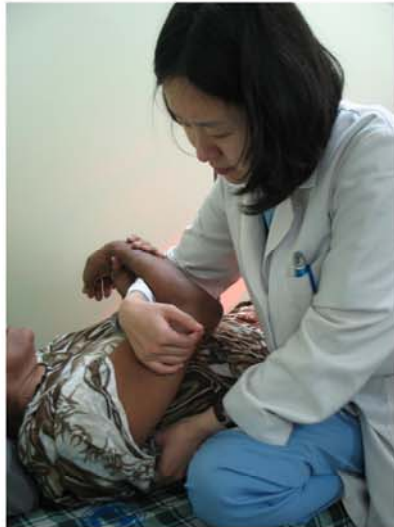
Physical Therapy Patient Receiving Treatment

In addition to our traditional Western style therapeutic practices, one of our doctors provides a more Eastern style massage therapy, designed to increase blood flow to key areas in order to increase the health of an organ or body part. It is known as Energy Mobilization Treatment (EMT).