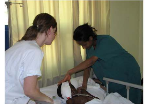
A patient recovering in the ICU

unit. After these types of procedures, the patient is usually discharged within the same day.