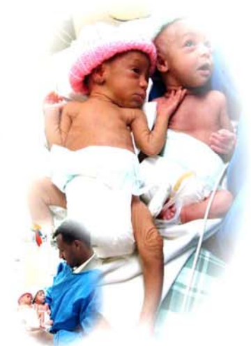
Twins experiencing their new world