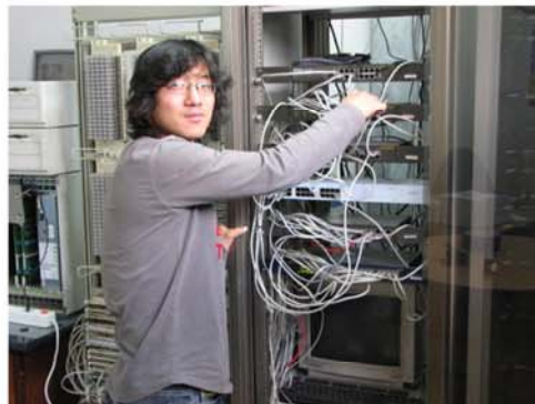
The Network Administrator is setting up a new user.

We also have two well-qualified computer technicians, along with remote support from Korea.