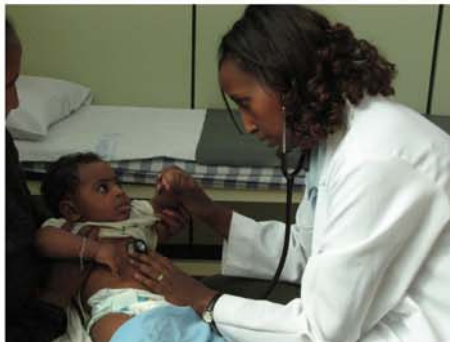
One of the pediatricians examines a baby.

MCM's pediatric department is concerned that children who come to MCM receive the best care possible. Our pediatricians encounter many cases every day, ranging from tuberculosis to a simple stomach ache. With their training and experience behind them, our pediatricians are ready to diagnose the children's illnesses and recommend their treatments.