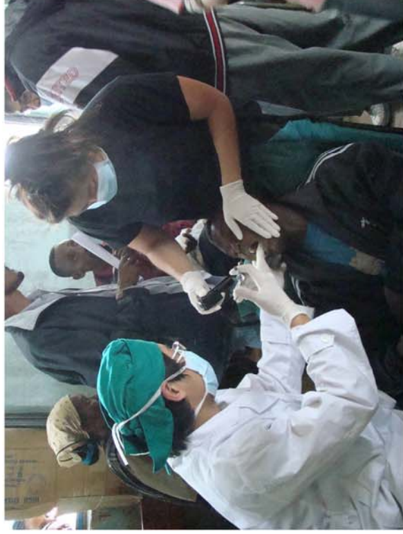
One of our dentists works with a volunteer missionary on a patient benefiting from our mobile clinic

Because dental services are not often found in a hospital setting, we feel blessed to be able to offer such a service.