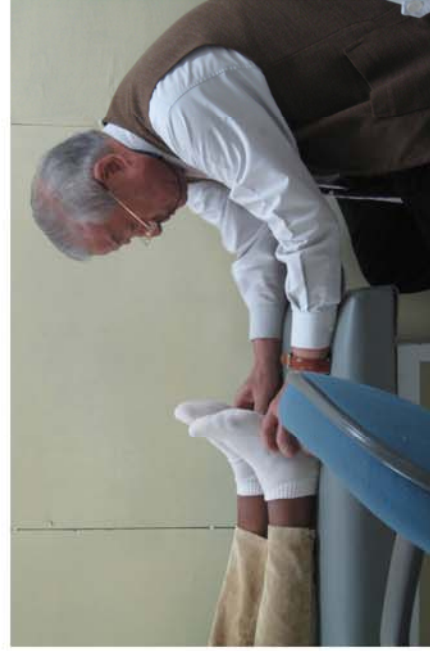
One of our doctors providing an acupuncture-based massage therapy

In addition to our traditional Western style therapeutic practices, one of our doctors provides a more Eastern style massage therapy, designed to increase blood flow to key areas in order to increase the health of an organ, or body part. It is known as Acupressure, or energy mobilization treatment (EMT).