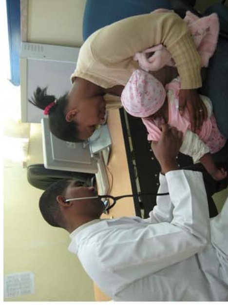
A pediatrician performs a routine check-up on a baby