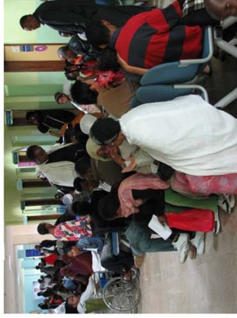
Outpatients waiting their turns to see the doctor.

The outpatient department is a very busy place, especially on Monday mornings, reflecting the pent-up demand from the weekend. Patients come from all over Addis Ababa and the countryside to receive medical treatment at MCM. Most of our doctors work every weekday and Saturdays, and are on call 24 hours a day. This is unique to MCM, as doctors in most other Ethiopian Hospitals are off on weekends.