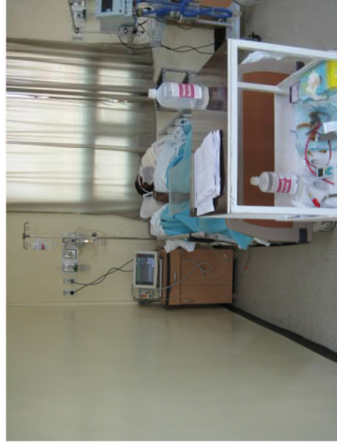
A patient recovering in the ICU

this care unit. After this procedure, the patient is discharged within the same day