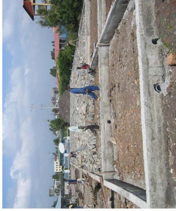
Construction of new laundry room/training center

MCM plans to grow even more and has yet to embark upon all of its plans for future growth and development. Some of our plans for the future include a second guest house, a nurses' college, a trauma center, clinic extension, a college of medicine, and expansion to over 500 beds.