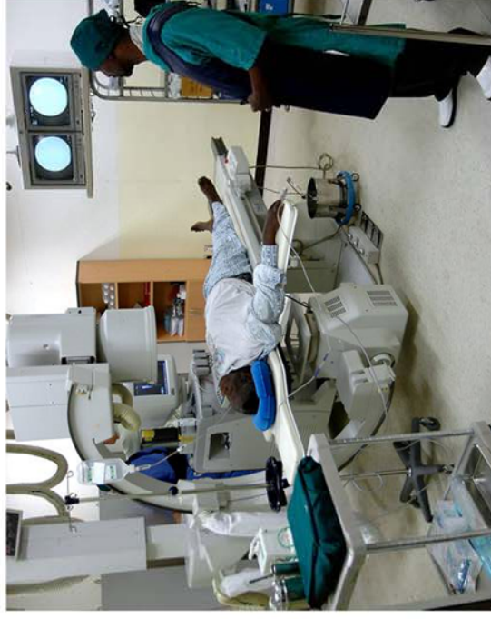
RADIOLOGISTS USE THE ANGIOGRAM ON A PATIENT